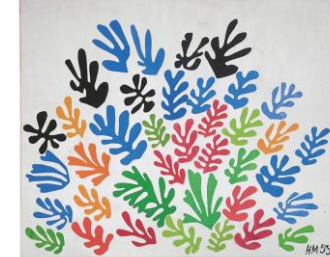
'The Sheaf' 1953