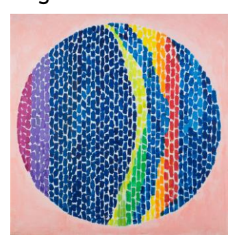
'Snoopy Sees a Sunrise' 1970