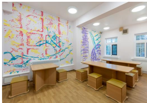
'Hospital Rooms' 2018-19