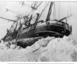
The Endurance stuck in pack ice