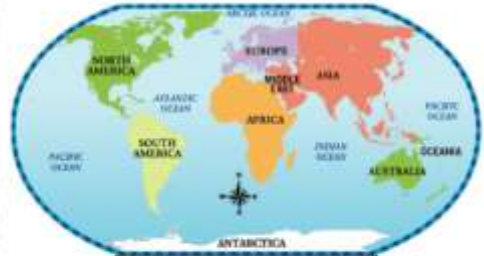
Shackleton travelled to Antarctic.