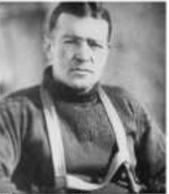
Sir Ernest Shackleton